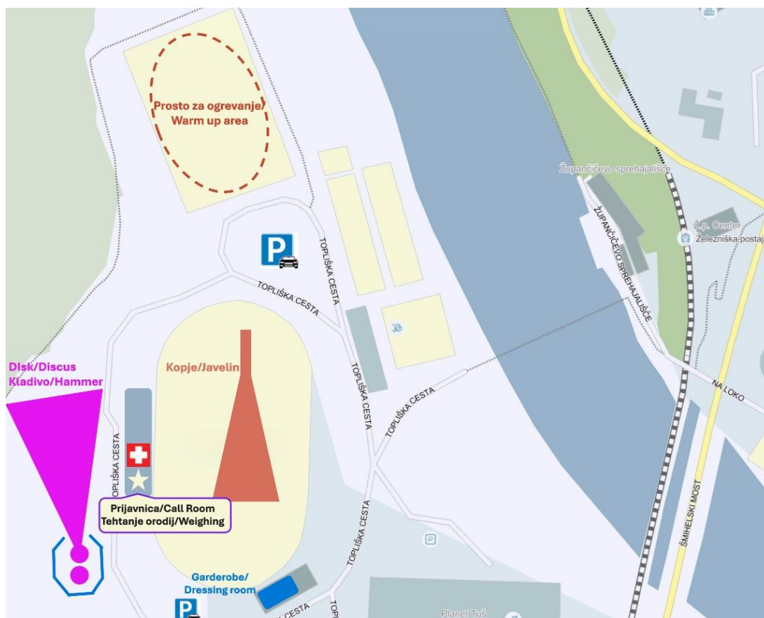
Figure 3: Stadium Portoval Novo mesto